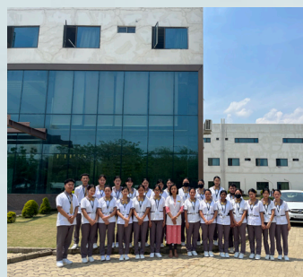
Olive Christian Hospital & Research Centre