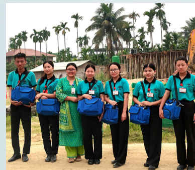
Rural community exposure