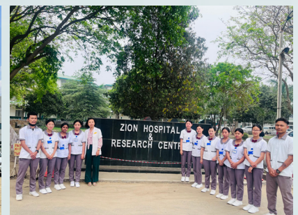
Zion Hospital & Research Centre