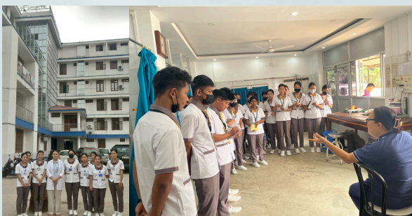
Nikos Hospital and Research Centre