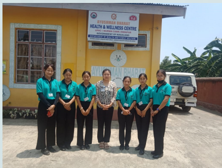
UPHC Burma camp